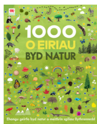
Author: Jules Pottle Publisher: Rily Publications