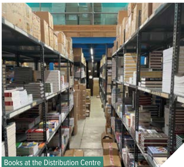
Books at the Distribution Centre