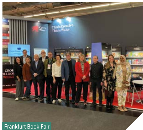
Frankfurt Book Fair

The new system, KNK Publishing, will enable us to work more efficiently, with more and better-quality information at our fingertips, and help us to improve our services to the publishing sector. The team at the Distribution Centre worked alongside industry leaders KNK to develop, implement and roll out the new system, and the switch from the old system to the new was made in March 2024.